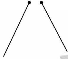
Durable, heavy duty connectors