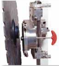
Quick disconnect coupling for blade