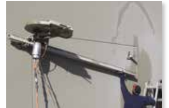
Versatile track system