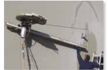
Versatile track system