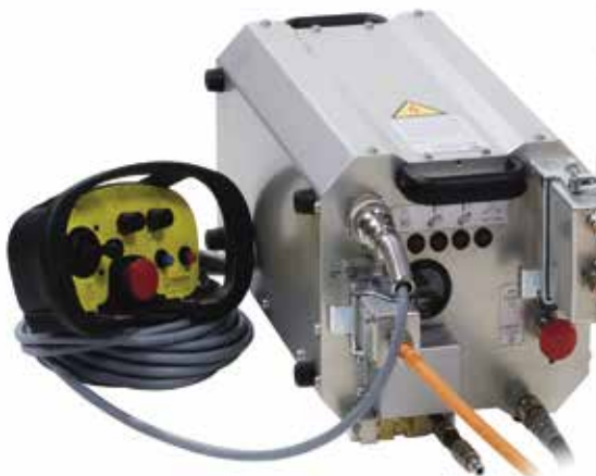
Pentpak 427 HF-power pack with Pentrunder autofeed system