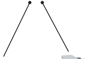
Durable, heavy duty connectors