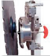
Quick disconnect coupling for blade