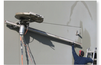
Versatile track system