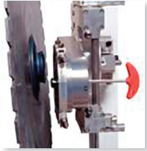
Quick disconnect coupling for blade