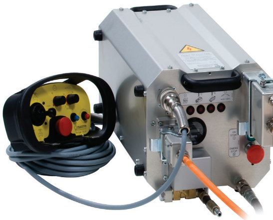
Pentpak 427 HF-power pack with Pentrunder autofeed system