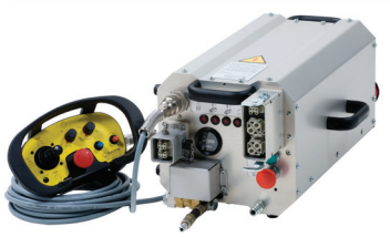
Pentpak 427 HF-power pack with Pentrunder autofeed system